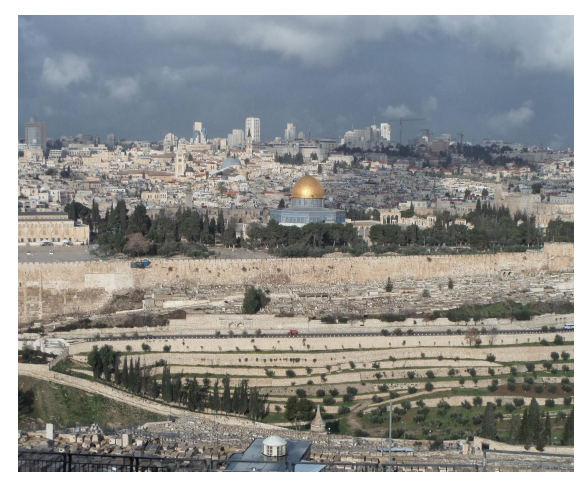
The City of Jerusalem.