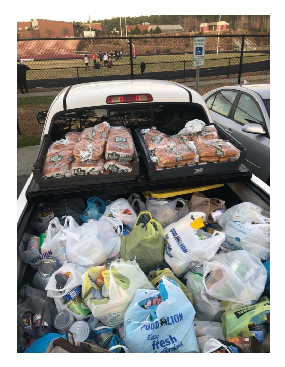
Food pantry distribution.

Grace Ministries' sport and food ministry teams collected all the foods needed for an Easter dinner and fed more than 100 families. They also distributed nutritious meals for families