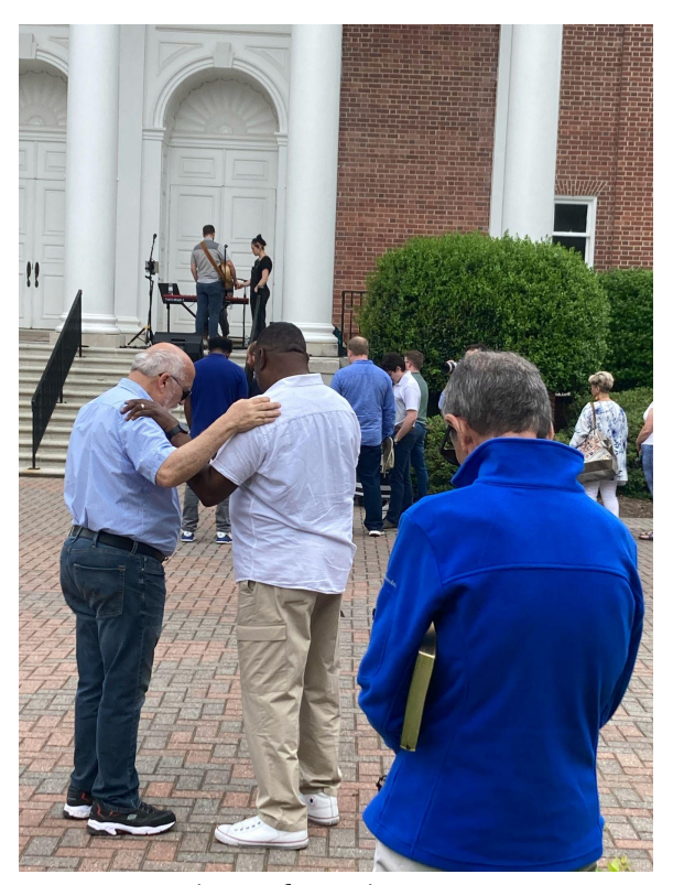
Praying on the seminary campus

Prayer teams from throughout the community converged at the Wake Forest Town Hall Plaza flagpole. The mayor of Wake Forest declared a proclamation, and proceeded to Southeastern Baptist Theological Seminary for a prayer meeting.