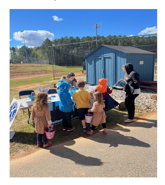
Youngsville East Egg Hunt.

This past year Grace Ministries partnered with local churches and community organizations to hold an Easter egg hunt in Youngsville with more than 400 children in attendance.