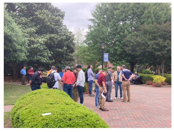
Attendees of annual prayer walk.

The Annual Wake Forest Prayer Walk was held on May 5, 2022 which was held in conjunction with the National Day of Prayer