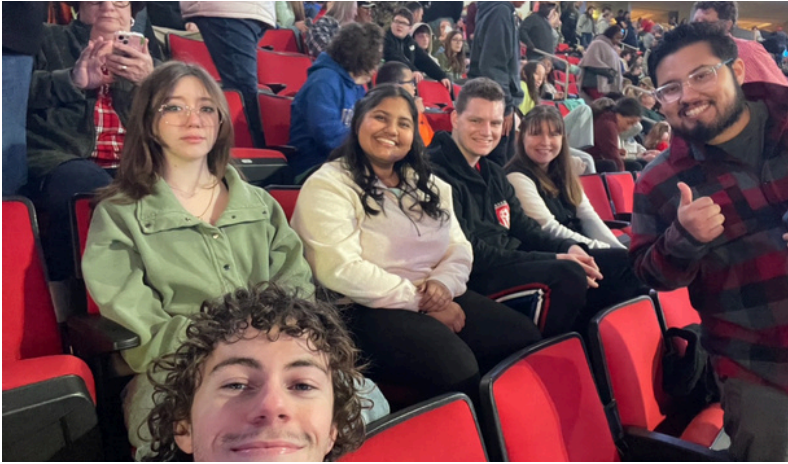
Pictured above are some of the Young Pros that attended Winter Jam