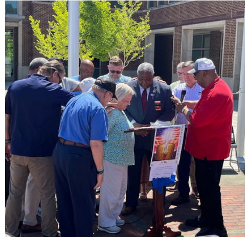
The 2024 National Day of Prayer