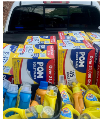
Some of the donated supplies