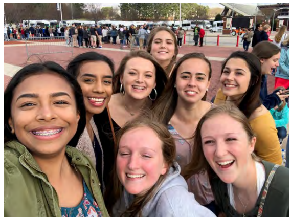
Winter Jam 2018

Grace Ministries sponsored eleven local area teens to attend the Winter Jam Concert on March 24, 2018. Winter Jam is an annual American music tour featuring contemporary Christian music, comedy performance and a tour speaker. It was a blessing to see four young ladies in our group accept Jesus Christ as their Lord and Savior. Our woman's ministry team followed up with discipleship and gave the girls Bibles and journals.