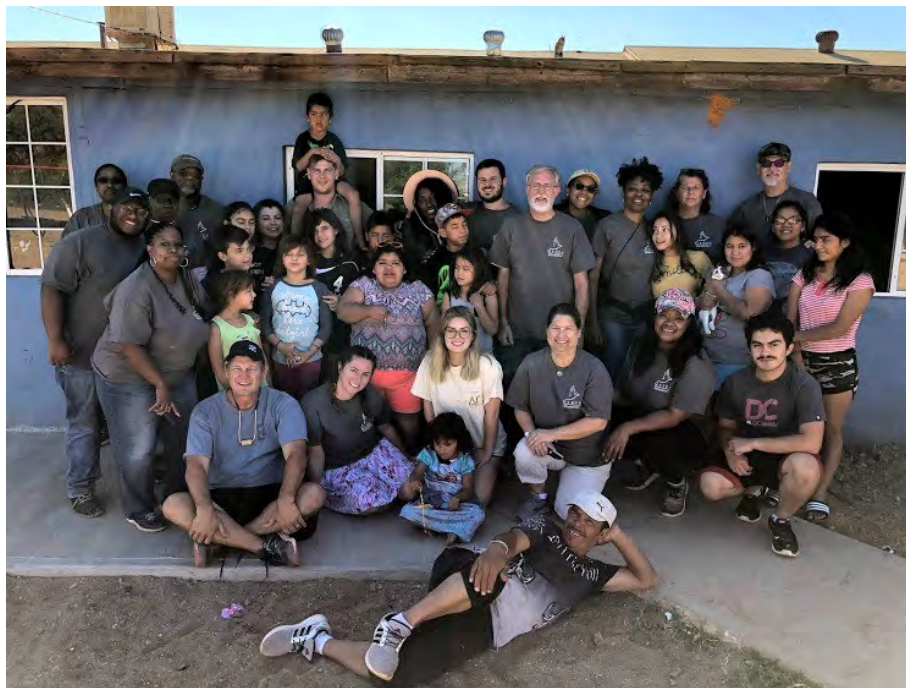
Grace Ministries USA missions team, children and staff at Casa Hogar Emmanuel Orphanage, Naco, Sonora, Mexico.

The response to our annual invitation to Casa Hogar Emmanuel Orphanage in Naco, Sonora Mexico was outstanding. This year's team members were from Friendship Baptist Church, The Pointe Church, Wake Forest Methodist Church, Southbridge Fellowship and Restoration Church. Our focus was to serve the children and staff of the orphanage through construction work; facility maintenance; providing, cooking and serving meals and teaching God's word to the children through vacation Bible school. Most importantly pray, play and love the children.