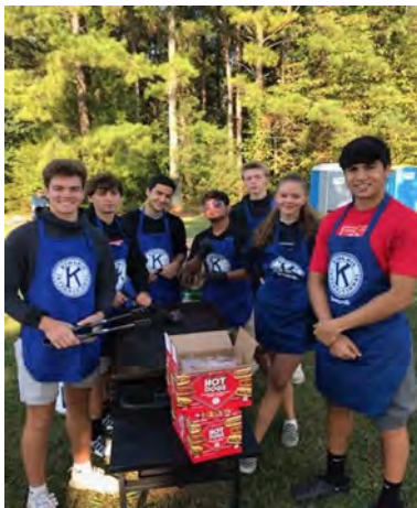
Sports Ministry Day