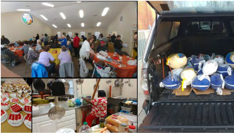
Our Daily Bread at Franklinton United Methodist Church