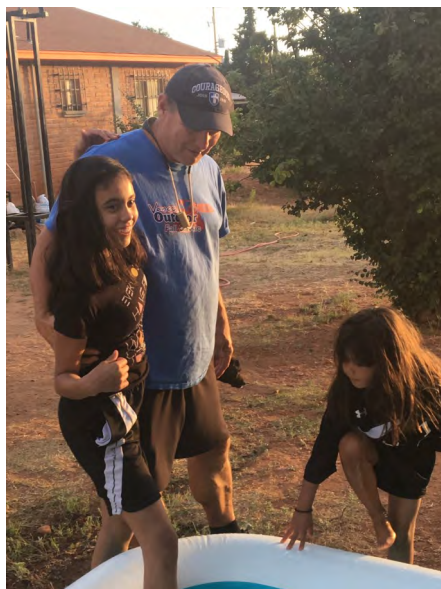
Celebration of Baptism at Casa Hogar Emmanuel Orphanage

The chapel was cleaned and craft supplies were replenished and organized. Team members brought extra suitcases containing donated clothes, shoes, and other items and they were sorted and distributed.