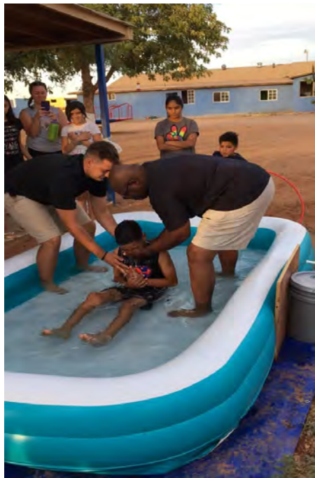
Baptism of one of the children at Casa Hogar Emmanuel

Our construction team made an adult picnic table and a smaller one for the little children, repaired bed frames, fixed leaky faucets and painted the bathrooms. Several of our team members treated all the children for head lice, cleaned all the children’s bedding and sprayed the orphanage for lice.