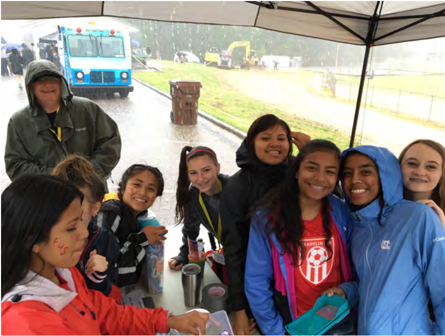
Community Easter Egg Hunt volunteers