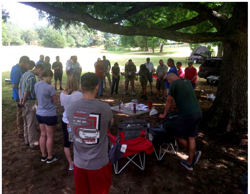
Attendees of the Annual Sporting Clay Classic praying for Gods blessings