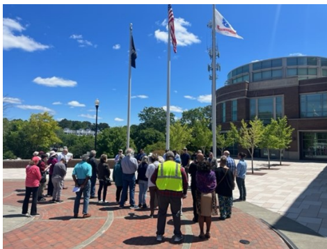
Prayer at the Wake Forest Town Hall

families. Afterwards, those in attendance went to the Southeastern Baptist Seminary grounds for a wonderful community worship.