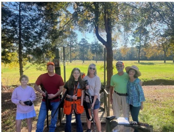
Family and friends on the range at Rose Hill Plantation