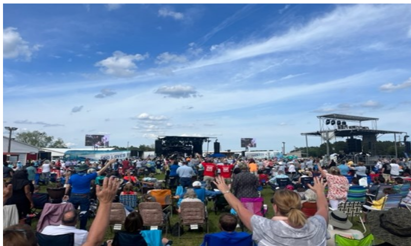
The Newsboys performing at the “God Loves You” Tidewater Tour