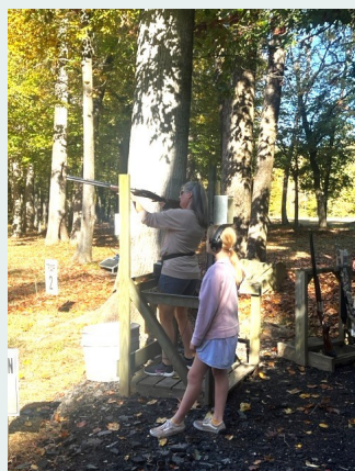
Mom and daughter en- joying the day