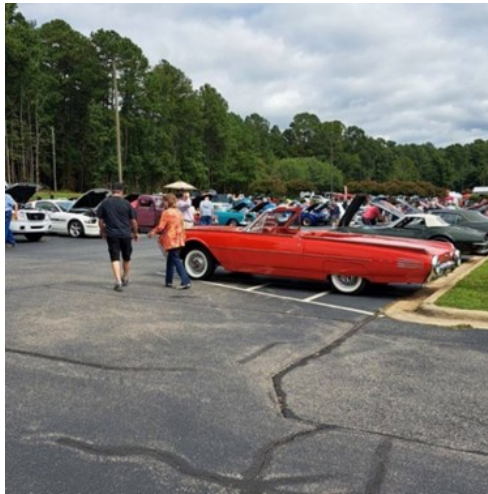
One of the many classic cars at the fall Festival & Car Show