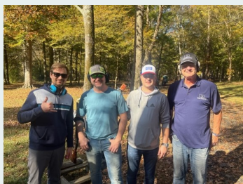
Great time of fellowship at the clay shoot

Grace Ministries held their Annual Sporting Clay Classic on Saturday, October 28, 2023, at Rose Hill Plantation in Nashville, NC. Rose Hill Plantation is a historic country estate with an 18 th century manor house. The sporting clay range has been featured on ESPN Outdoors and is home of the Rose Hill Sporting Clay Challenge, one of the country's most elite clay tournaments. The clay shoot range has automated skeet and trap for the novice as well as the experienced sports shooter.