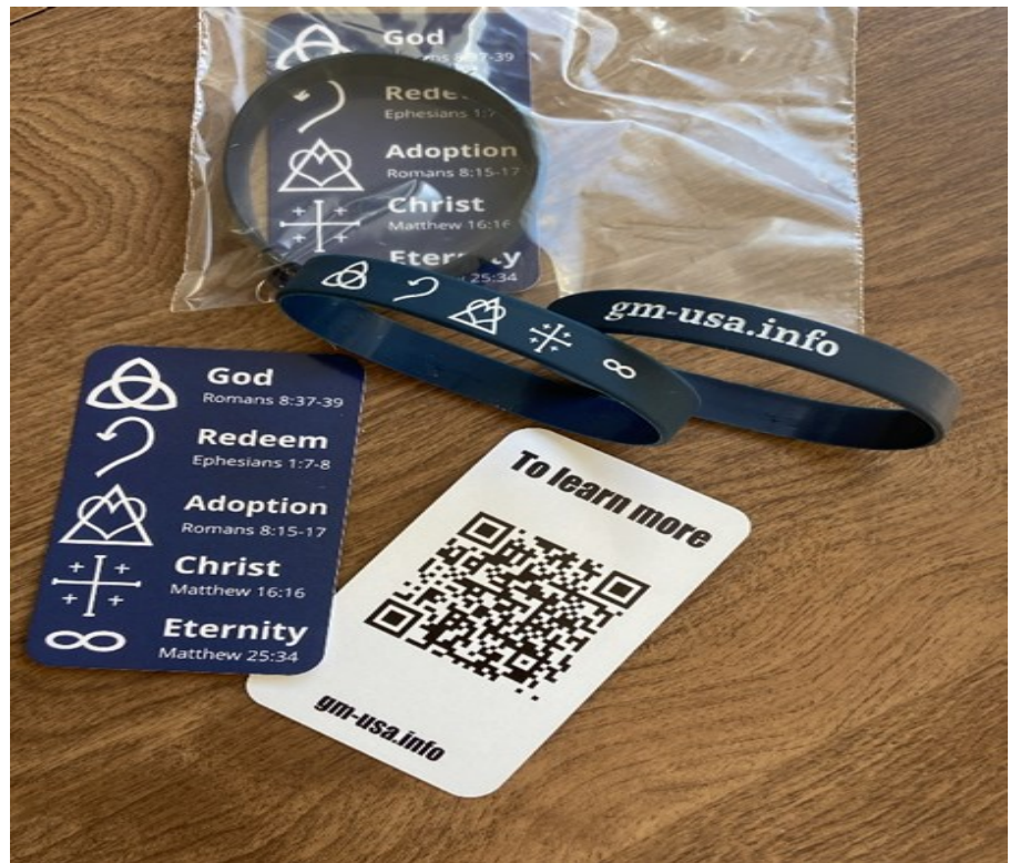
Grace Ministries bracelet and gospel card